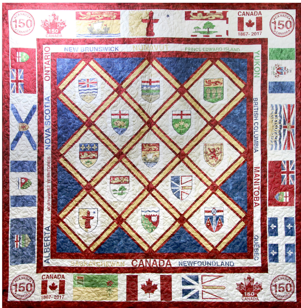
FREE PATTERN • Coast to Coast to Coast • 72" x 72" by Elaine Theriault of Northcott

Northcott Canada 101 Courtland Avenue Vaughan, Ontario L4K 3T5